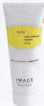
Organic Solar Defense SPF 30

Tired of layering on an SPF over your moisturiser for added protection? Image Skincare Organic Solar Defense SPF 30 is a moisturiser and sunblock in one and comes in a generously sized tube.