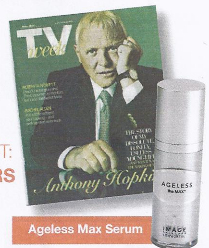
Ageless Max Serum

Image Skincare's 'cosmeceuticals' range approaches skin health through professional, at-home treatments. This Ageless Max Serum is a star product for all types of ageing skin. Packed with neuropeptides and botanical stem cell technology, it is designed to be used morning and night under moisturiser. Expensive yes, but cutting-edge.