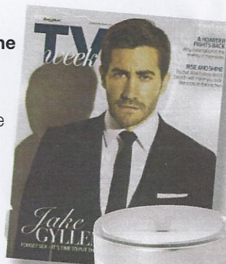
THE MAX Creme

This unique cream uses two different strains of plant stem-cell technology to prevent and reverse signs of ageing and it is packed full of antioxidants. It is especially beneficial to dehydrated, mature and compromised complexions.